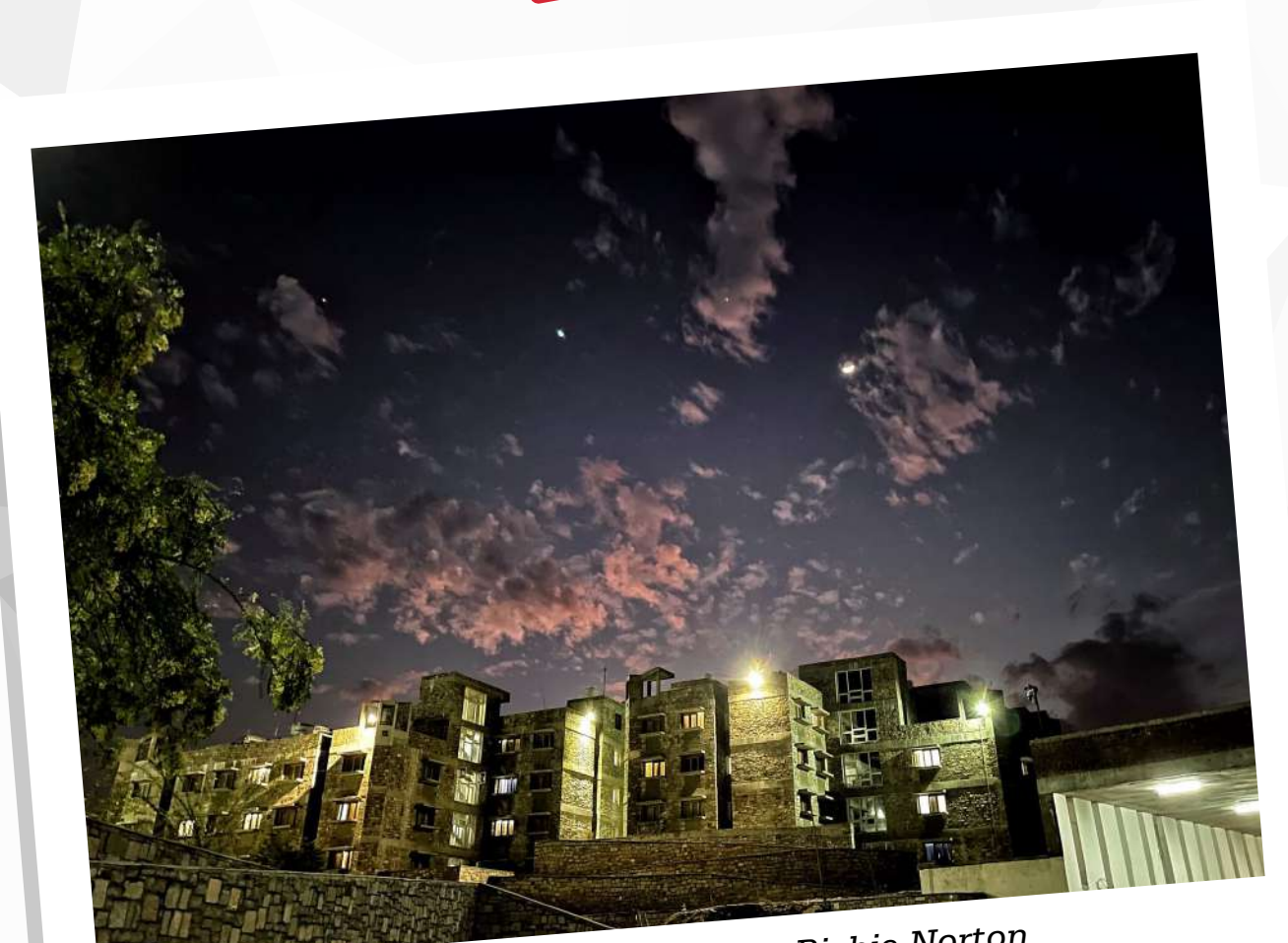
Every Sunset is an opportunity to reset - Richie Norton